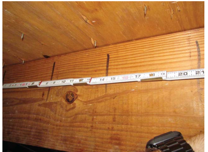
6in nail pattern