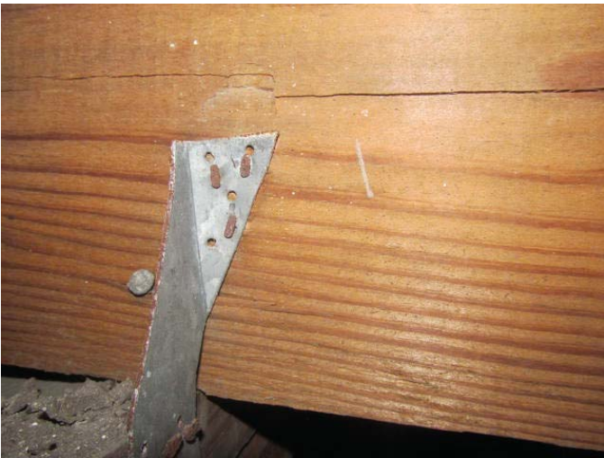
Clips - with minimum three nails