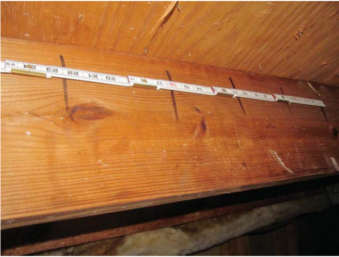
6in nail pattern