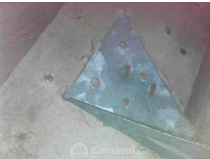
Toe nails - clips with only two nails