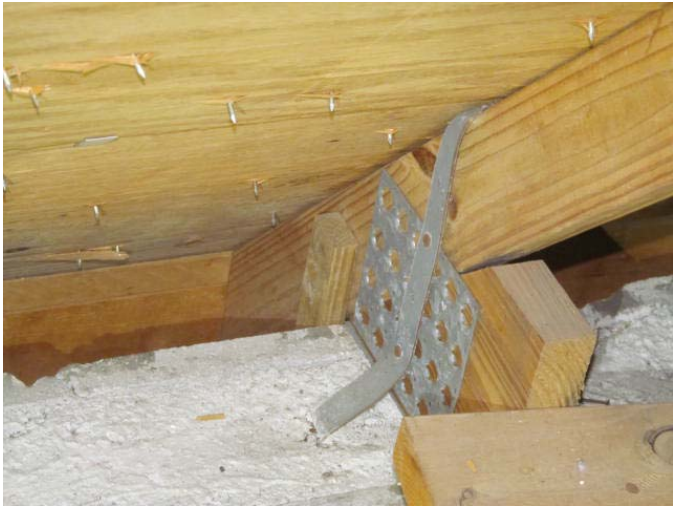
Toe nails - straps further than 1/2"