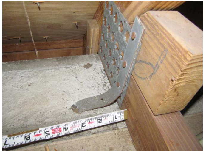
Toe nails - straps further than 1/2"